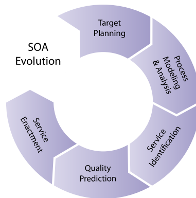
Fig. 1. SOA Evolution Method

Figure 1 shows the outline of such a method.